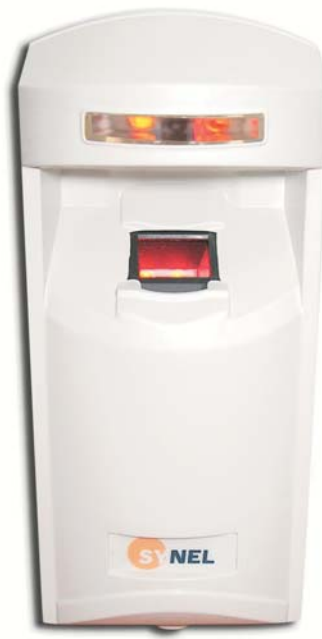
Optical sensor - PrintX-fpr/OP