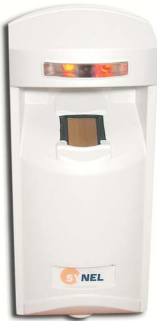
TC sensor - PrintX-fpr/TC

A biometric fingerprint reader - the highest security level for personnel recognition